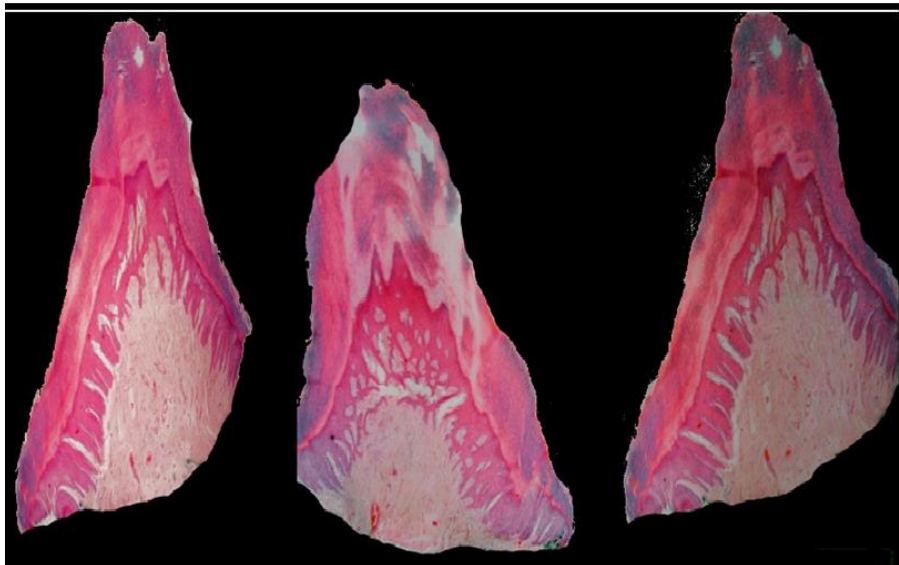
FIG. 2. The image shows acanthotic epidermis with hyperplasia and orthokeratosis. The center is composed of dense collagen mixed with fibroblastic proliferation and ectatic vessels.